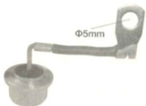
FD91E-35P3 (+) / FD91E-35N3 (-)