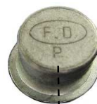
FD1-25P/N BOTTOM VIEW