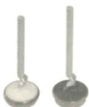
FD20B-25PZ2 (+) / FD20B-25PNZ2 (-)