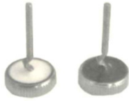
FD70B-35PZ3 (+) / FD70B-35NZ3 (-)