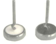
FD70B-35PZ2(+) / FD70B-35NZ2 (-)