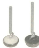
FD20B-25P3 (+) / FD20B-25N3 (-)